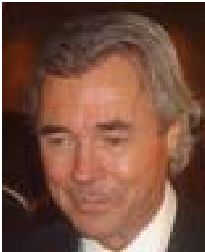
Honourable Pierre Pettigrew

Canada's Minister of Foreign Affairs on "Coherence and Commitment: Implementing the New International Policy Statement"