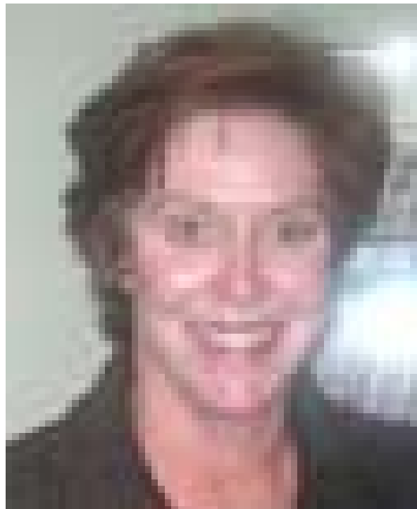
Honourable Aileen Carroll

Minister for International Cooperation on Canada's aid obligations